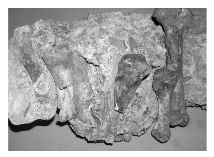
Fig. 7. On Cyprus, bone beds containing the petrified bones of a dwarf hippopotamus ( Phanourios minor ) are found along the coast. The bones are considered not only holy, but also healthy.