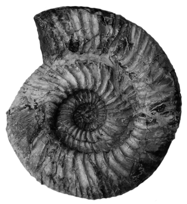
Fig. 5. The majority of fossil ammonites has a thightly spiralled form like a ram's horn or a coiled snake.

Ammonites are extinct marine molluses, usually with a flat spiralled shell; some are helically-spiralled, others are straight and not spiralled at all. They are distant relatives of the squids, octopuses and cuttlefish of today. Ammonites