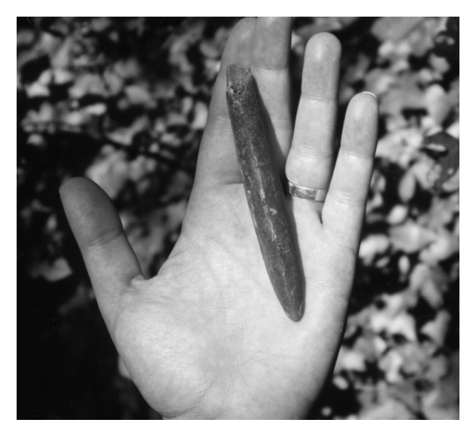
Fig. 4. The preserved part of a fossil belemnite has the typical shape of a bullet or dart.

makes things only worse, whether the fingers are those of the devil or of St Peter.