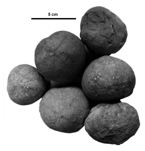
Fig. 2. Fossil sea urchins (Echinoidea) resemble eggs, but are in reality the petrified exoskeletons from which the characteristic spikes or needles are lost.

The club-like spines of the Jurassic echinoid Balanoci daris , known in folklore as Jewstones, because they were, amongst others, found in Ancient Judea, have a bladder-like shape (GOULD, 2000). Consequently, ingested in powdered form, they were used to treat ailments of the urinary system, such as kidney stones. This is a straightforward example of sympathetic medicine. Their use is of old days, and they have been used as charms since c. 650 BC.