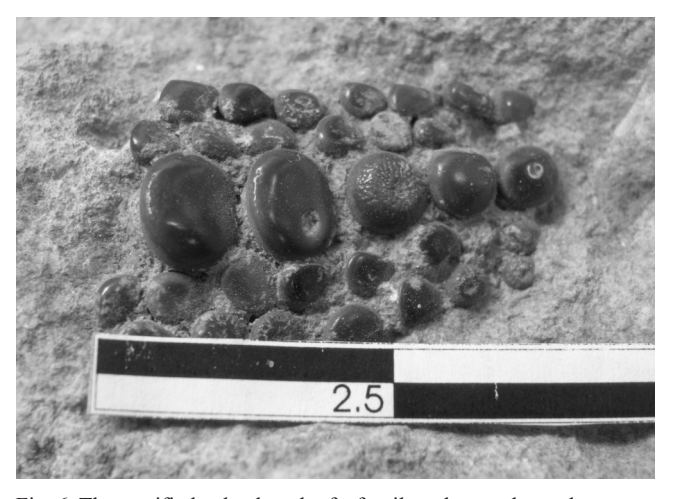
Fig. 6. The petrified palatal teeth of a fossil sea bream, better known as serpents' eyes or toadstone.

The palatal teeth of sea breams often have a pale yellow or orange-coloured centre called the acrodin cap, surrounded