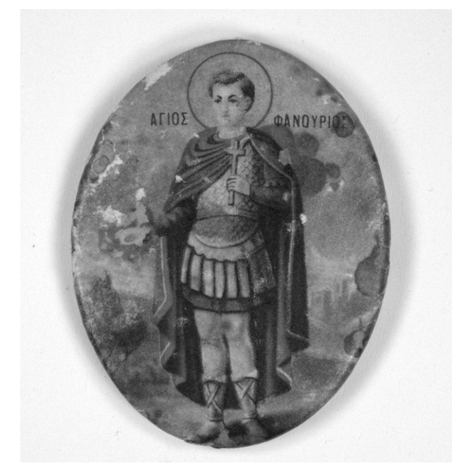
Fig. 8. The unfortunate young saint Phanourios who died at the steep cliffs of Cyprus in an attempt to escape his enemies.

Quite similar in idea is the use of dragon bones ( long gu ) and dragon teeth ( long chi ) in Chinese traditional medicine since early historical time. One of the first reports about this use dates back to the early centuries and comes from Shennong's famous pharmaceutical handbook. Dragon bones are cooked and ground into a powder. Usually the powder is mixed with a number of herbs and other substances, such as oyster shell and ginger. In traditional Chinese medicine, dragon bone is considered to have sweet and neutral properties, and is associated with the heart, kidney and liver meridians. Its main functions are to calm the spirit, heart and liver, and to prevent fluid loss. Typically, dragon bone is used as a sedative to reduce stress and calm the mind, and to help treat